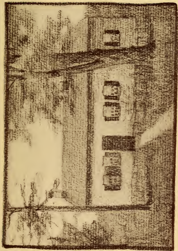
Where Fanny Crosby was born